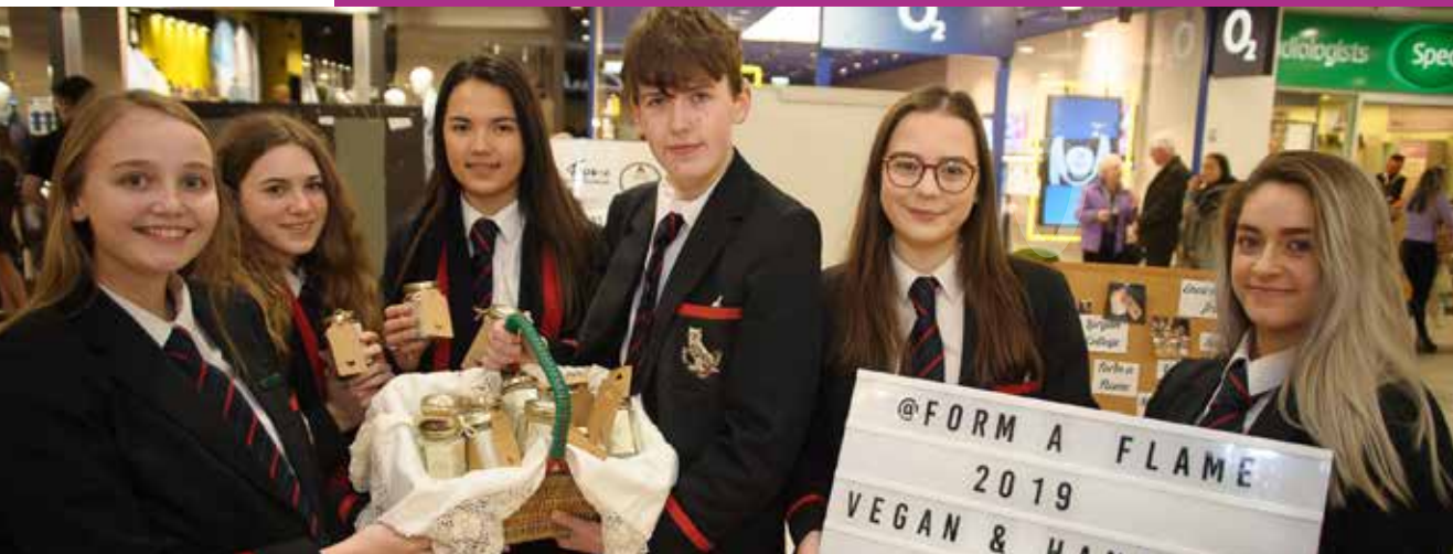
Form a Flame, from Lurgan College, who reached the NI final in 2019. Photo taken at the regional Trade Fair (inside Rushmere Shopping Centre) selling their bespoke, handmade candle products.

Over the year the student company will regularly meet with their Business Volunteer who will support them to work through the key eight milestones outlined on YE Online and help them to prepare for the Company of the Year competitions and selling events.